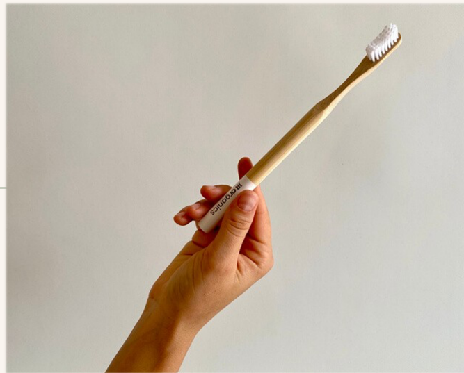
Bamboo "For me"